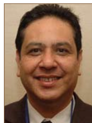
THWE, Tun Tun